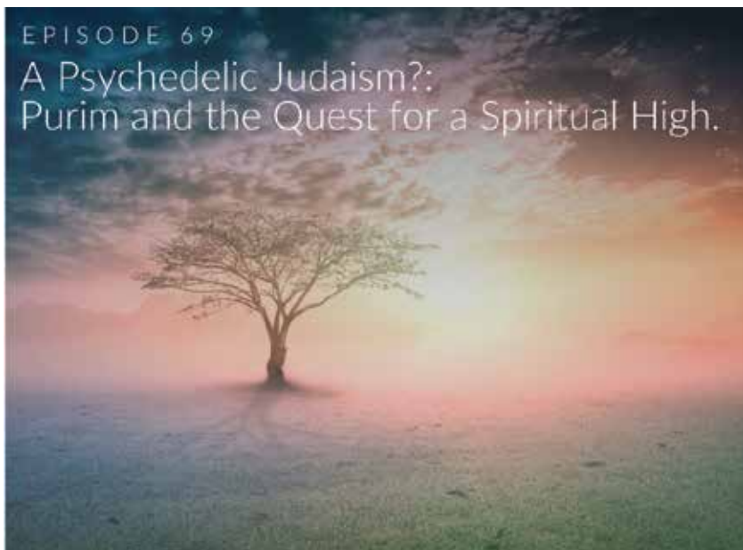
THE 'LIVING Jewish' podcast.