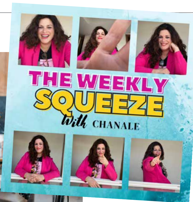
'THE WEEKLY Squeeze' podcast. (Screenshot)